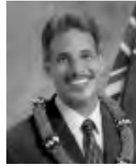
JAMES "DUKE" AIONA JR.

Message from Governor Linda Lingle and Lt. Governor James R. "Duke" Aiona, Jr. presented to